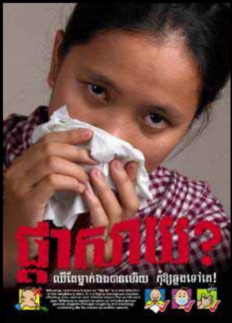
Cover coughs and sneezes