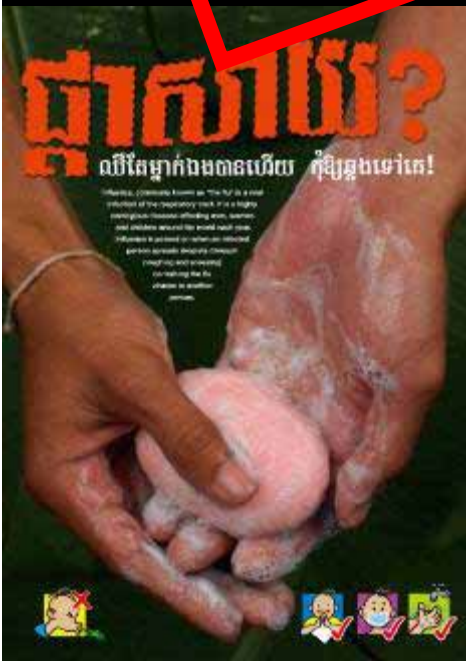
Wash hands thoroughly with soap frequently