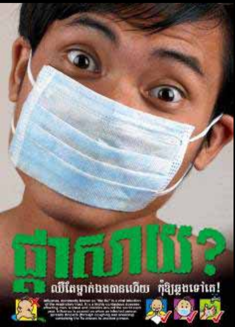
Wear a mask if symptomatic