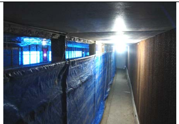
Photo 3: View from the doghouse through the air inlet curtain opening into the house.

The inlet curtains are opened enough to maintain the negative pressure over 0.055 so that the TJP 2155 inlets open. This will increase the airspeed over the birds but cuts it in half compared to using 100% the inlet curtains. This means that if 3 fans are running after 14 days of age and the airspeed would normally be 3 \times 21,250 = 63,750 \text{ cfms} \div 340 \text{ f}^2 (cross section house) = 188 \text{ fpm} \div 2 = 94 \text{ fpm} over the birds (norm for 3d week is up to 100 fpm). With 4 fans running it would go up to 4 \times 21,250 = 85,000 \div 340 \div 2 = 125 \text{ fpm} .